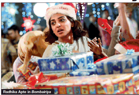
Radhika Apte in Bombairiya

Bombairiya , presented by Kreo Films FZ and Beautiful Bay Entertainment, the film releases on January 11.